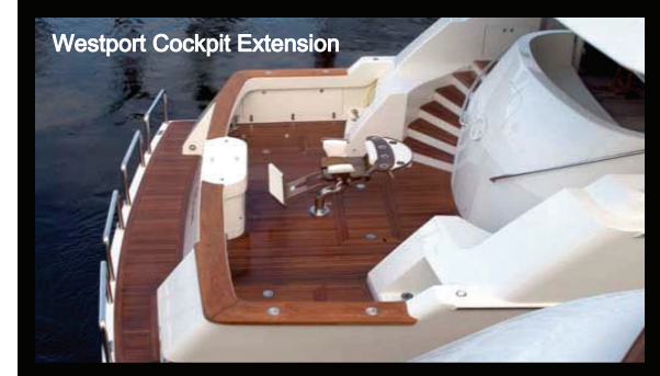
Westport Cockpit Extension

CAPTAIN'S & OWNER'S LOUNGE FAX ,PHONE, INTERNET ,COMPUTER VIKING LONGHOUSE: BBQ PIT , FISHING WI-FI