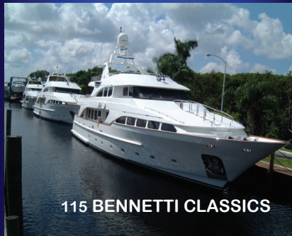
115 BENNETTI CLASSICS

Extensions: complete with Fuel tanks, BBQ, Refrigeration, Teak Decks, Paint and Underwater Lights